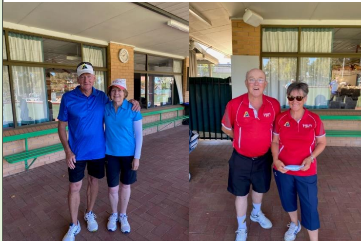
Thanks to all who came to our Christmas Dinner.