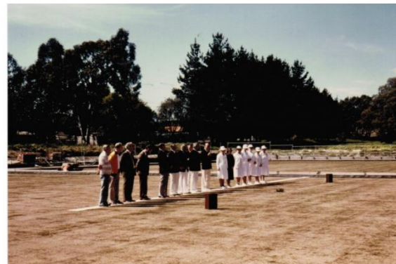
OPENING OF GREENS 1984