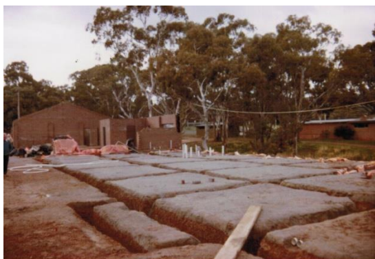
CLUBROOMS UNDER CONSTRUCTION

While the greens were being established and our games and practice were being held at Morphett Vale, work began on the construction of the Clubrooms with some of the labour being performed by young people from the “work for the dole” or RED scheme as it was then known.