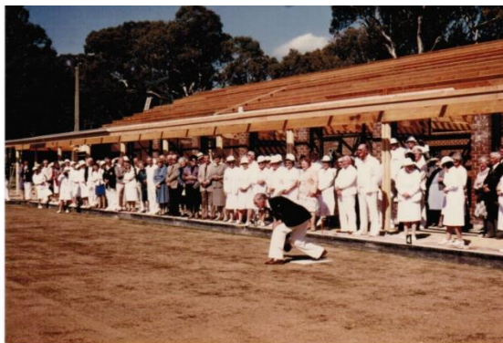
OPENING OF GREENS 1984