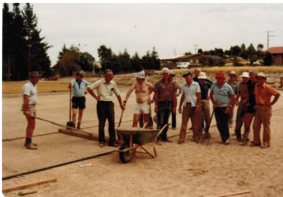
LEVELLING OF GREENS