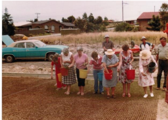
PLANTING FIRST GREEN 10/12/84 SECOND GREEN 23/12/84

While the greens were being established and our games and practice were being held at Morphett Vale, work began on the construction of the Clubrooms with some of the labour being performed by young people from the “work for the dole” or RED scheme as it was then known.