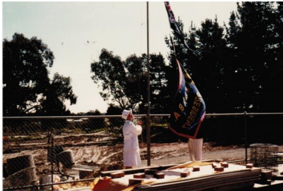
OPENING OF GREENS 1984

The Committee did write to the SA Government asking whether the Queen could officially open our Clubrooms during her visit in 1986, (she visited the nearby Aberfoyle Park High School at this time) but by that time her official engagements had already been finalised so she was unable to come to our Club. It appears that there was some embarrassment when it was leaked that she may visit us.