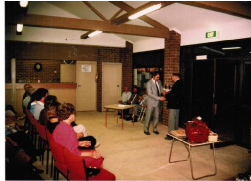
HANDING OVER OF CLUBROOMS 1985