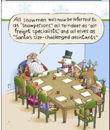
The Year Santa Hired a Consultant

We are taking a Christmas break, but Senior Fitness Classes will resume at HVBC on Friday 12 th January. Friday's 3pm-3.45pm. $10.00 cash.